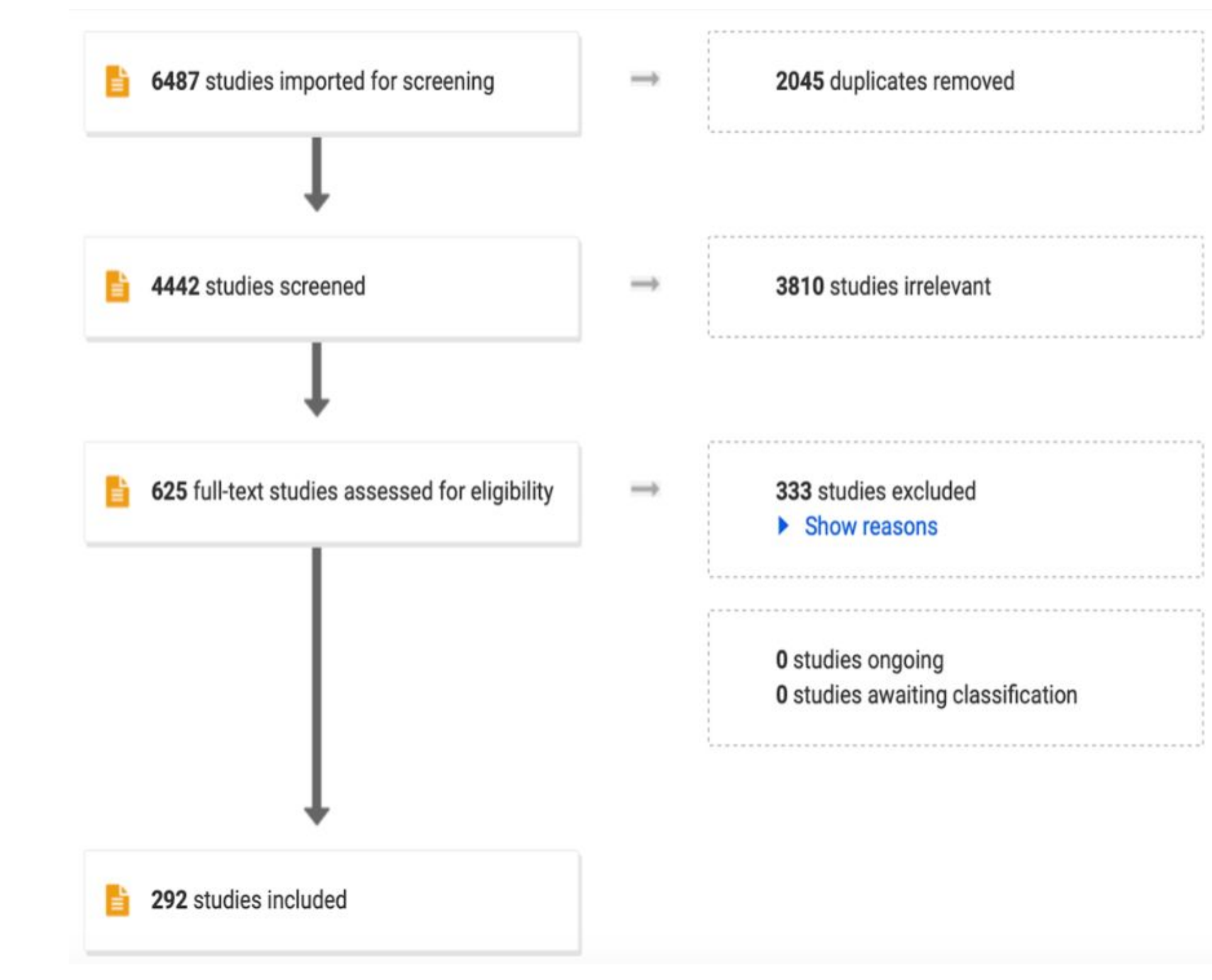
Figure 2: PRISMA Diagram created by Covidence

The PRISMA flow diagram below depicts the flow of information through the different phases of our systematic review.